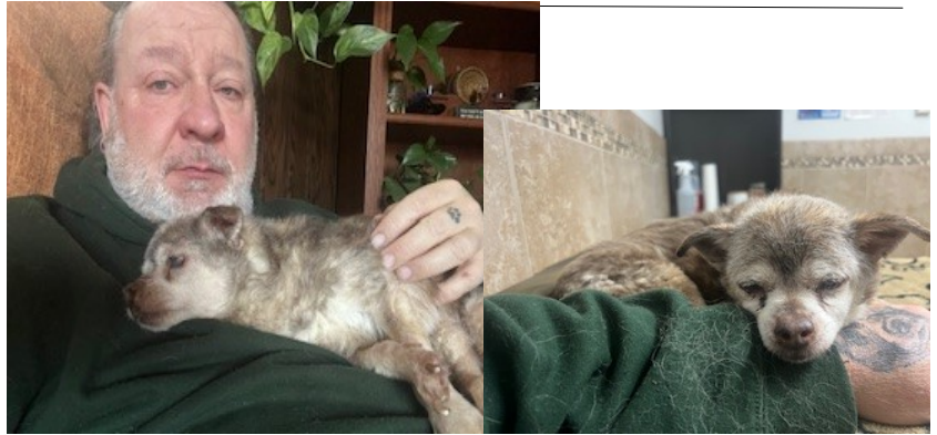
REST IN PEACE DUBBY

https://www.facebook.com/groups/wwwsevenspringsmountainvillashoa