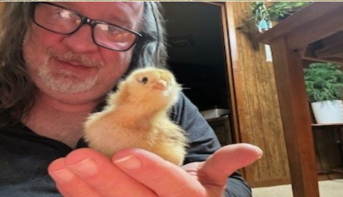
Tom's new chick