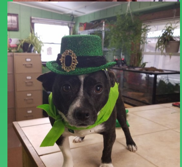
Jax & Tito Celebrating St. Patrick's Day

your cabinet doors open and shutting your water off when you leave. Thank you!