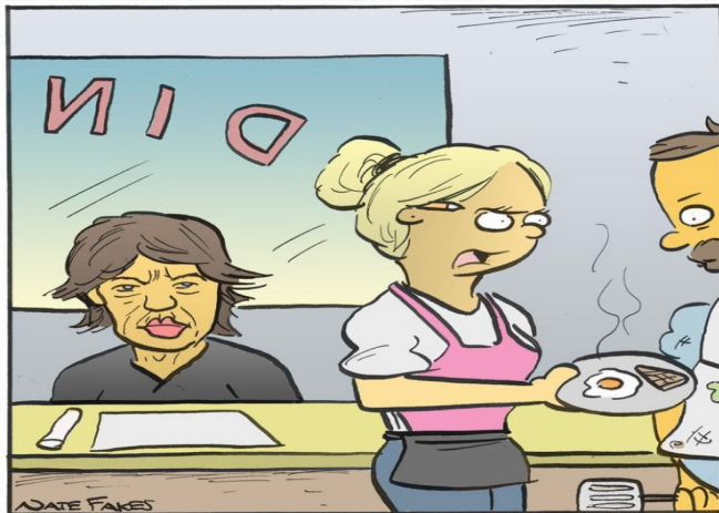
"He's sending it back...again! I swear this guy can't get no satisfaction."