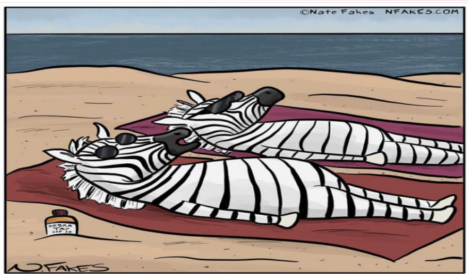
"I hope I don't get any tanning lines."

LORD, PROTECT PATTY FROM THE SPECIAL SAUCE, LETTUCE, CHEESE, PICKLES, ONIONS AND SESAME SEED BUN.