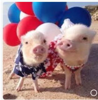
HAPPY JULY 4TH

grounds is underway. Please park boats, trailers, campers between buildings 7-8 per council's resolution from a few years ago. See page 2 for rules.