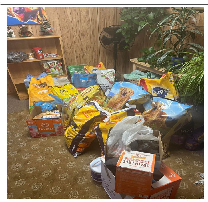
THANK YOU FOR ALL THE DONATIONS TO THE HUMANE SOCIETY! MOUNTAIN VILLA HOMEOWNERS YOU ROCK!!