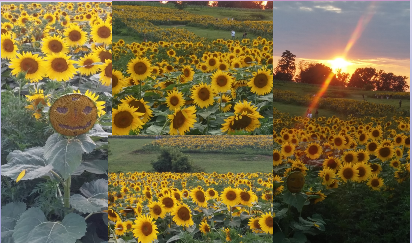
Sunflower Festival in Monongahela, PA

"SOMETIMES YOU HAVE TO LET GO OF THE PICTURE OF WHAT YOU THOUGHT LIFE WOULD BE LIKE AND LEARN TO FIND JOY IN THE STORY YOU'RE LIVING."