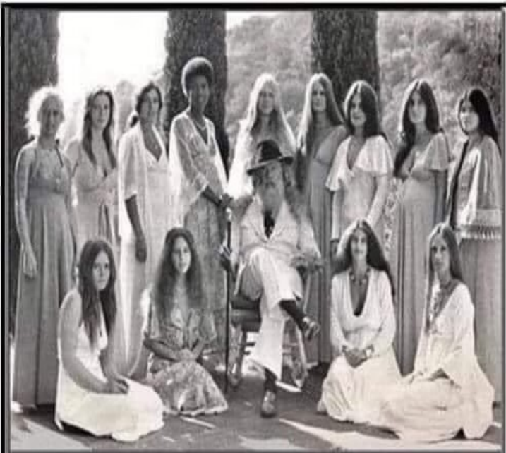
How does a hippie polygamist count his wives? 1 Mrs. Hippie, 2 Mrs. Hippie, 3 Mrs. Hippie...