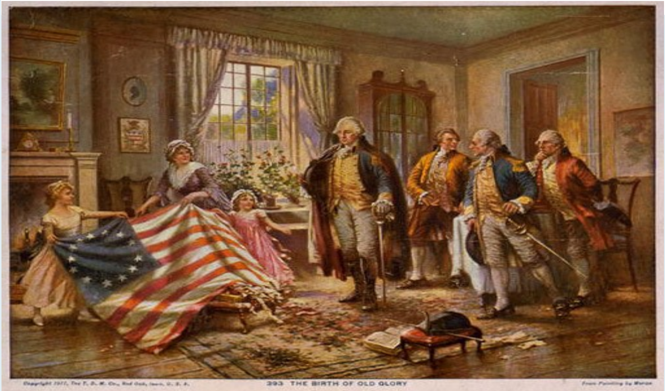
Betsy Ross showing the United States Flag to Benjamin Franklin and others.

Credit: Moran, Percy, artist .“The Birth of Old Glory . 1917